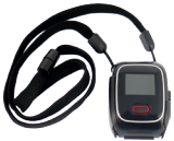
Neck Smart-fix system