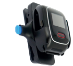
Belt clip Smart-fix system