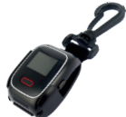
Carabiner Smart-fix system